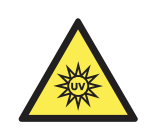
SUN PROTECTION Protective clothing and sunscreen may be required for extensive outdoor use.